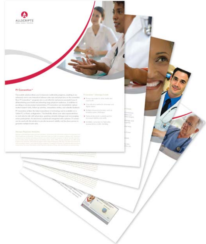
product sheet series