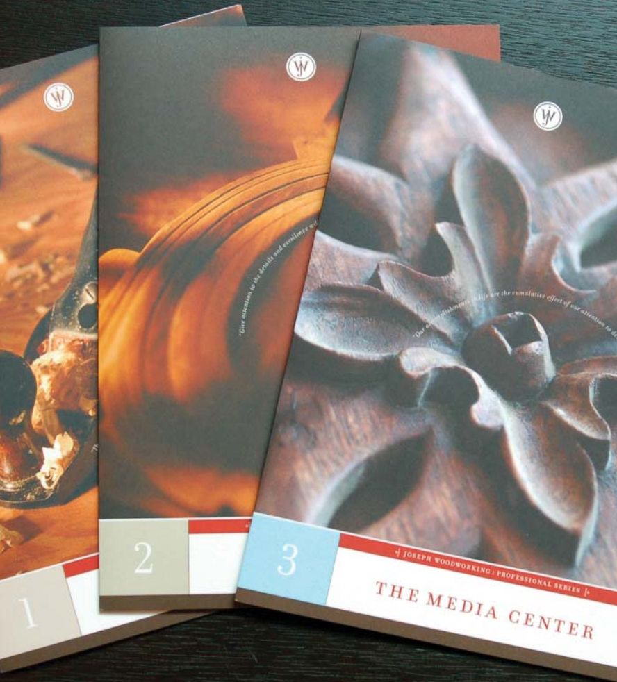
product brochure covers (detail)