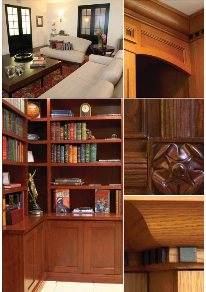
custom photography samples

Please feel free to contact us at 630.587.4033 if you would like to request samples or find out more about this ongoing project.