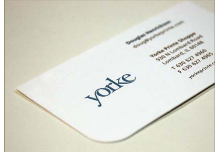
logo (above) & business card (below)