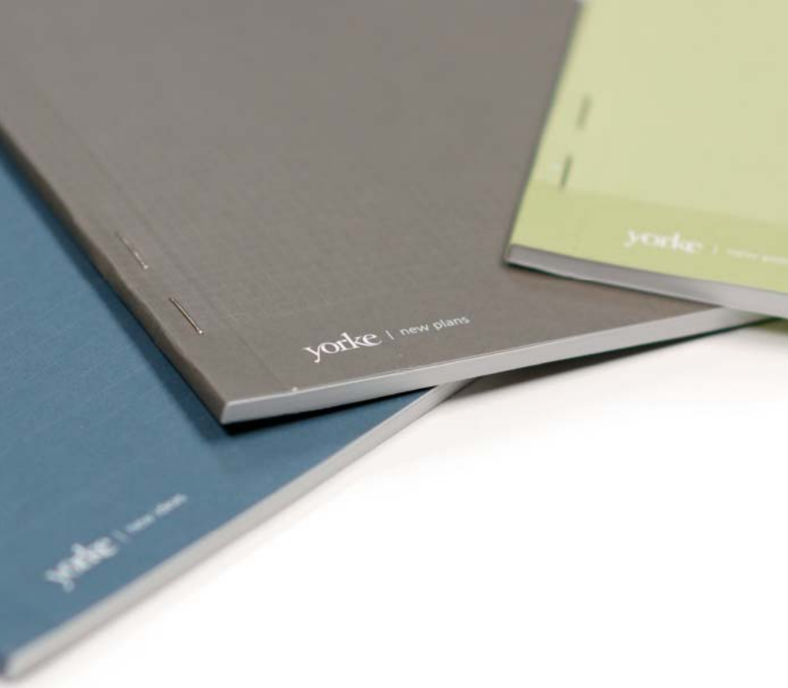
self-promotional sketchbook set