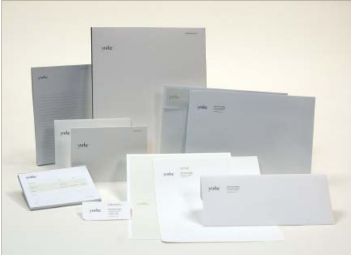
extended stationery system